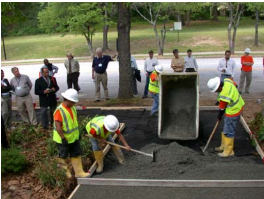
Scene from Pervious Pavement Demonstration