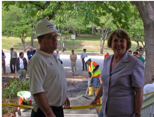
Scene from Pervious Pavement Demonstration

PHOTOS FROM OUR RECENT ACI 2007 SPRING CONVENTION HELD APRIL 22 -26.