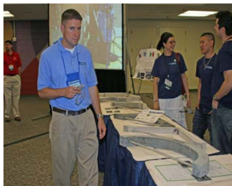
Scenes from Student Competition